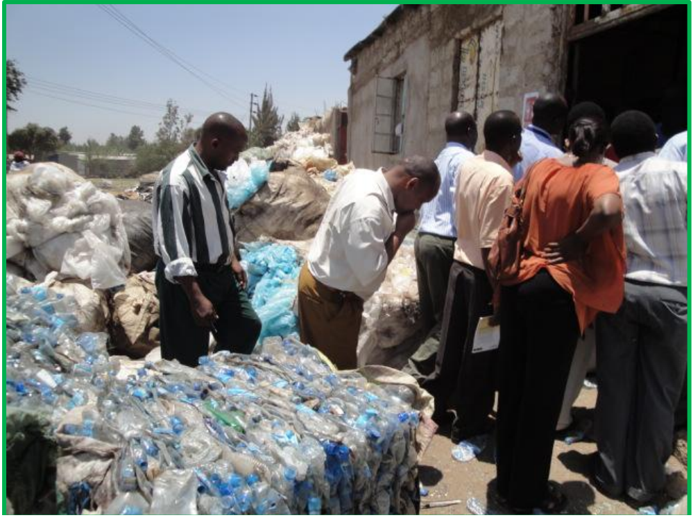
A tour to buy back centre -Arusha