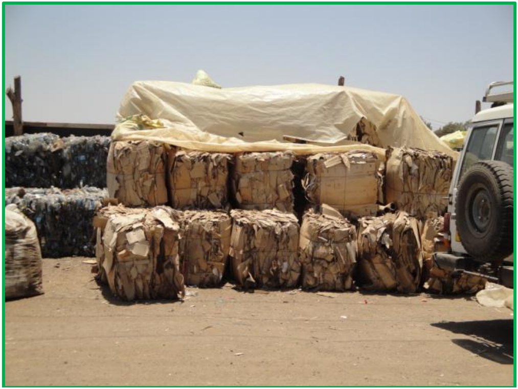
Bales of cardboard boxes at the buy back centre