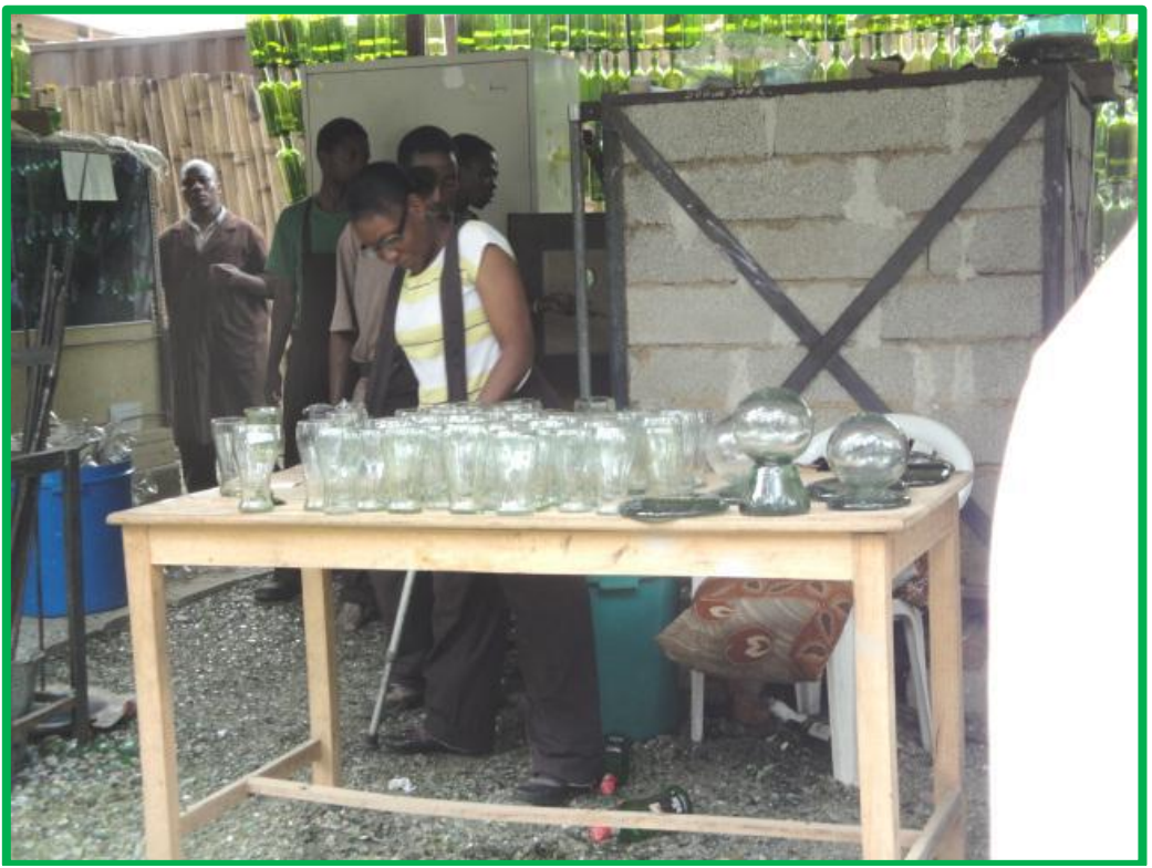
(a) Glass recycline