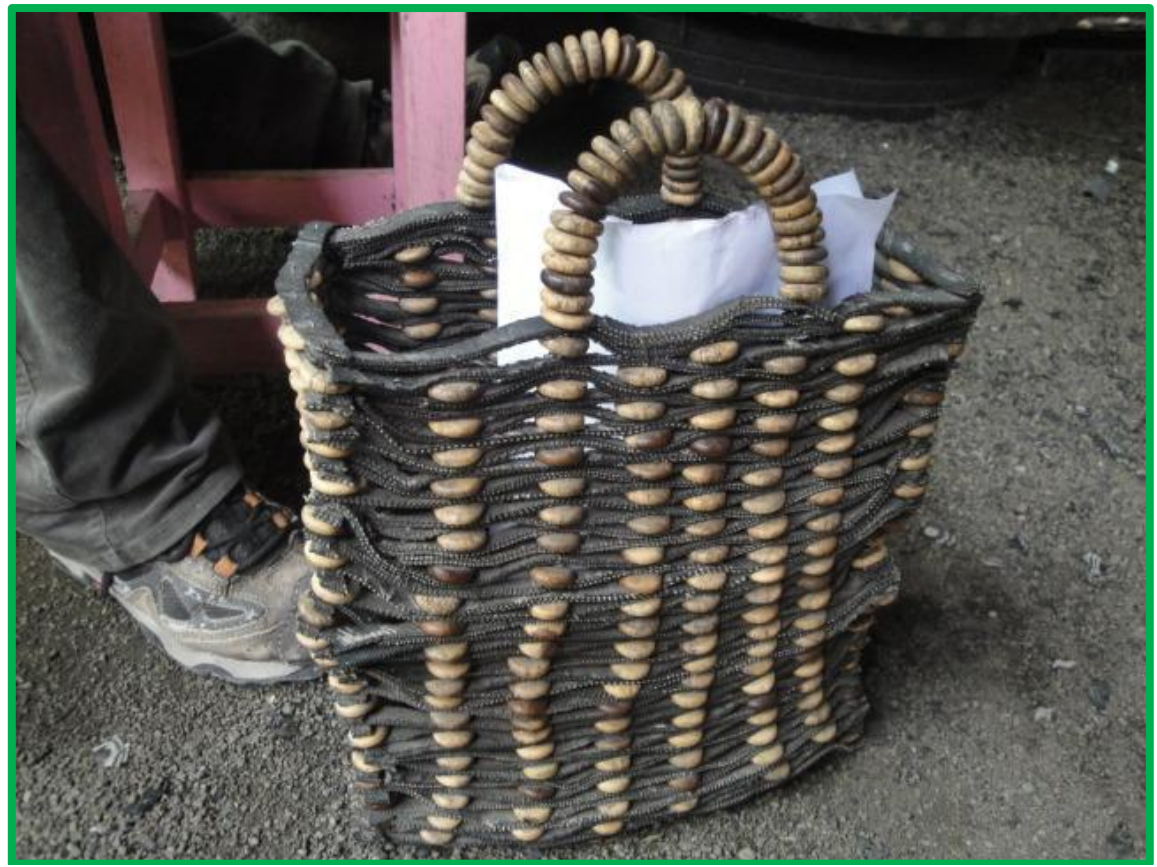
Tyre recycling(baskte made up of recycled tyres)