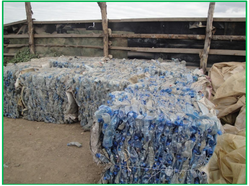
Bales of Plastic bottles waiting to be transported