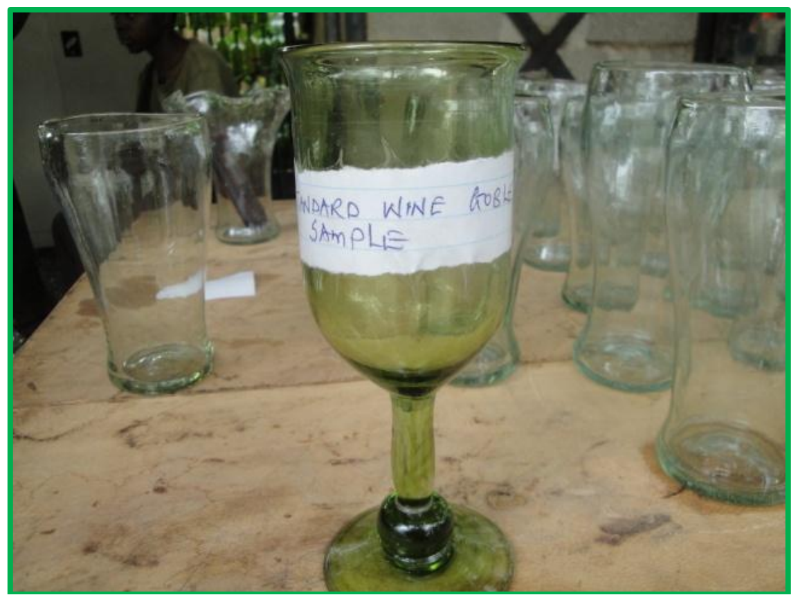
(b) Glass recycling