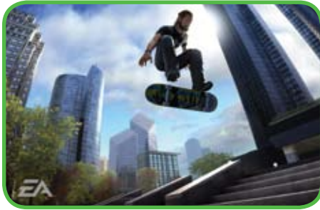
Scene from Electronic Arts' breakthrough game 'Skate' - developed in Vancouver